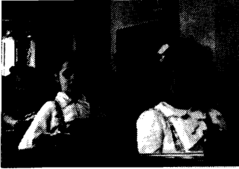
Class of 1946