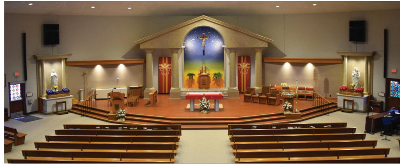
The redesigned sanctuary back wall at St. Anne Church in East Moline includes new canopies over the tabernacle and the devotional altars to Mary and Joseph.

● two smaller canopies built over the devotional altars of Mary and Joseph, and ● oak beams with new accent lighting