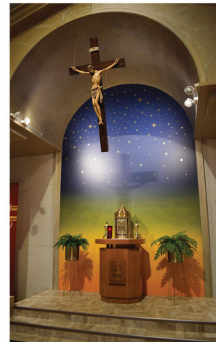
A closer look at the raised tabernacle and the new painting behind it. The church's crucifix was retained in the redesign.

The first Mass was celebrated in the Lyric Theater on Seventh Street on the third Sunday of May 1919. Ground was